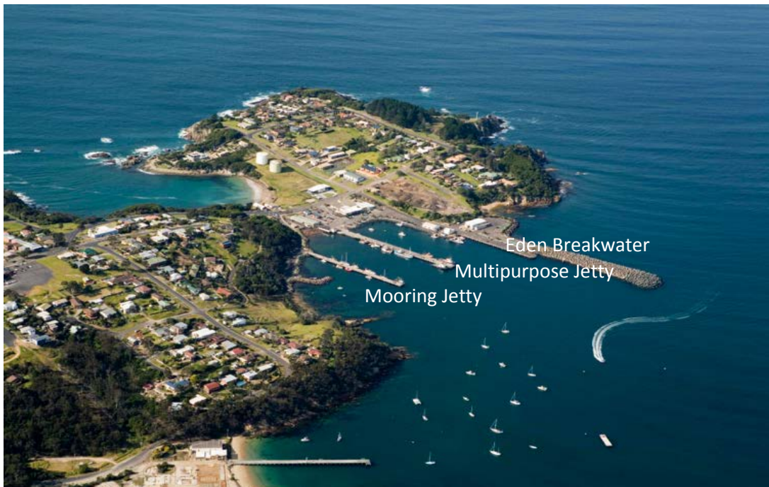
Figure 1 The location of the Breakwater Wharf in Snug Cove, Eden (referenced from Department of Primary Industries - Lands, 2014).