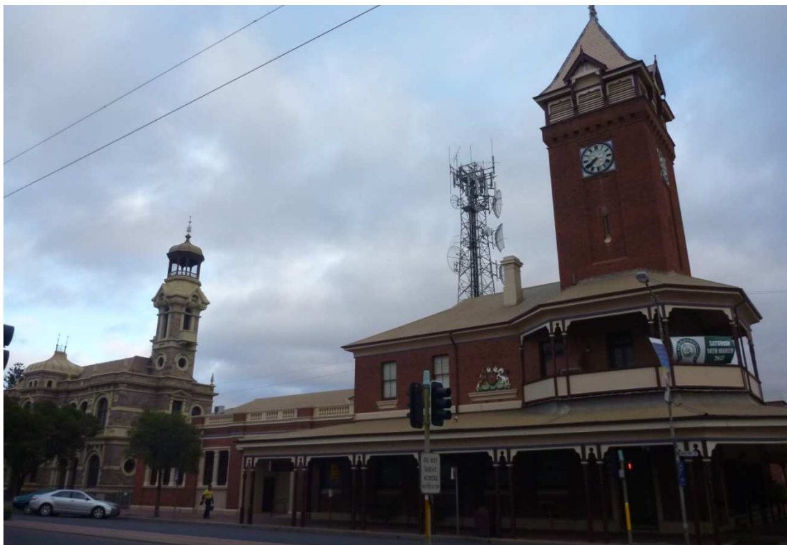
Figure B View from Argent Street (looking north) at the telecommunications tower behind to the historic Post Office and the retained (Argent Street) section of the former Town Hall. (Source: GML Heritage, March 2015).