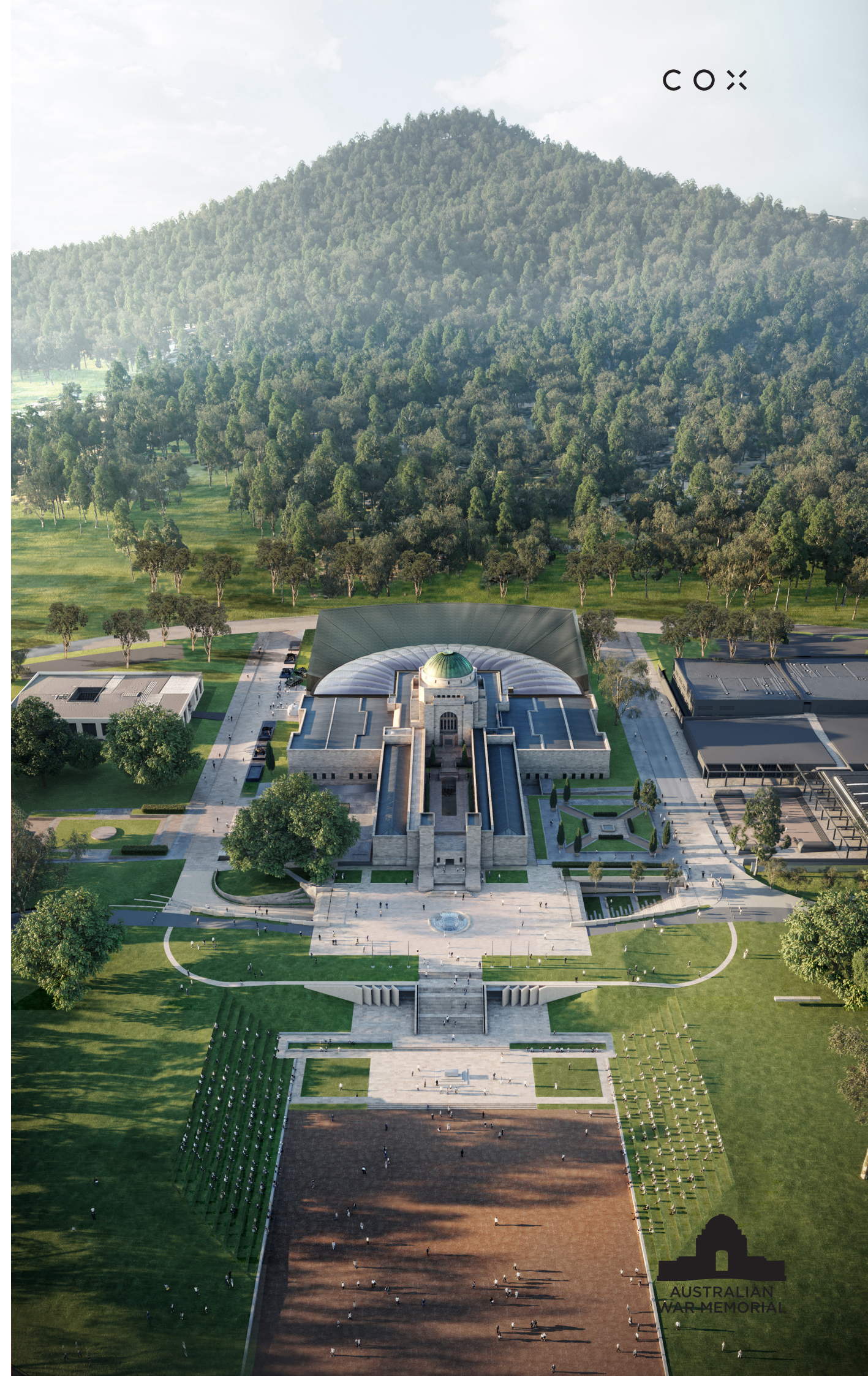
1 - View of Overall Development from Anzac Parade