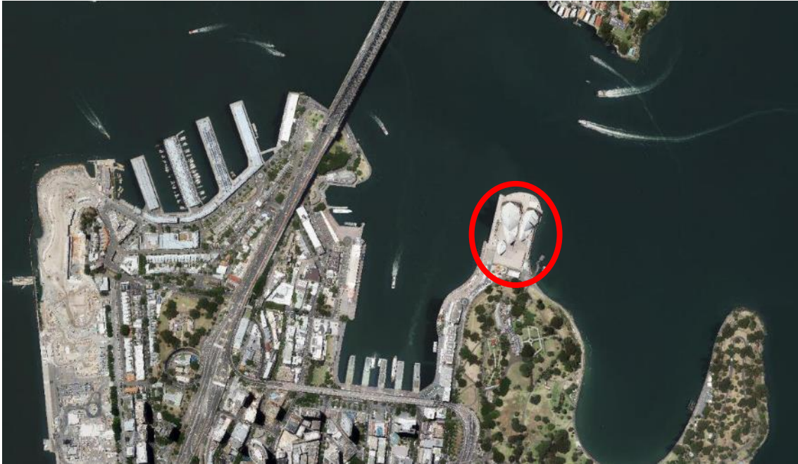
Sydney Opera House – Location Map