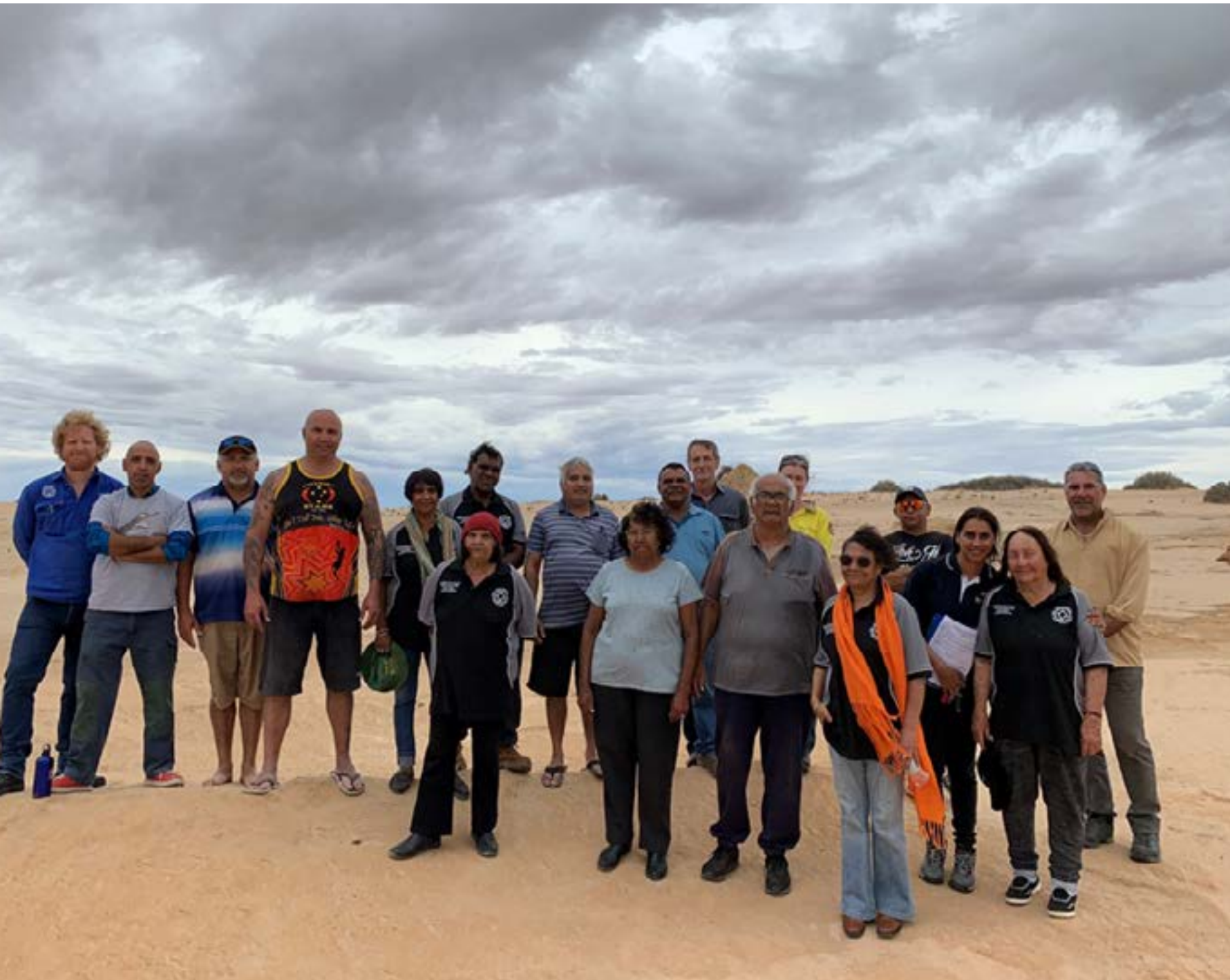
This agreement outlines the protocols and steps required to carry out research within the Willandra Lakes Region. The intent is to provide clear direction of expectations and timelines, to provide a meaningful and respectful engagement framework for working in the Willandra Lakes.